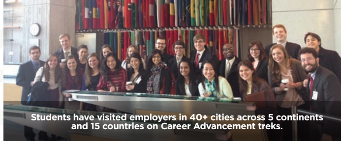
Students have visited employers in 40+ cities across 5 continents and 15 countries on Career Advancement treks.